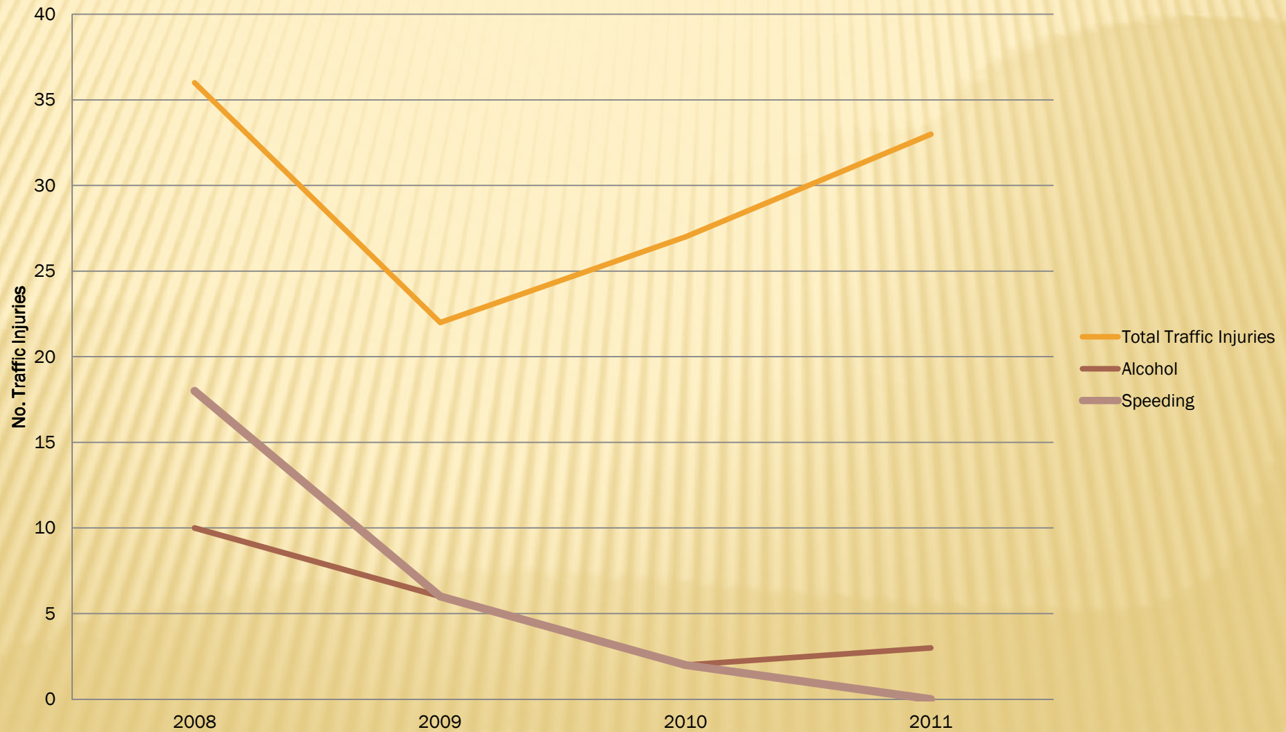
Traffic Injuries